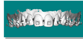
Scan of upper arch

After taking your scan, we will send it to the SureSmile Digital Lab where individual tooth models will be made. Then the doctor will examine your teeth on a SureSmile computer and determine the design needed for your SureSmile custom archwires, which we will insert at your next appointment.