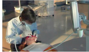
3-D intraoral scanning

This unique procedure is essential to keeping your treatment on an accelerated schedule because it is used to build a 3-D model of your teeth on the computer. The doctor analyzes the model of your teeth to diagnose treatment issues and design your custom archwires. So you can see the scan is the first step to offering you faster treatment.