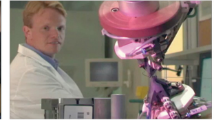
Customized robotically-bent archwires